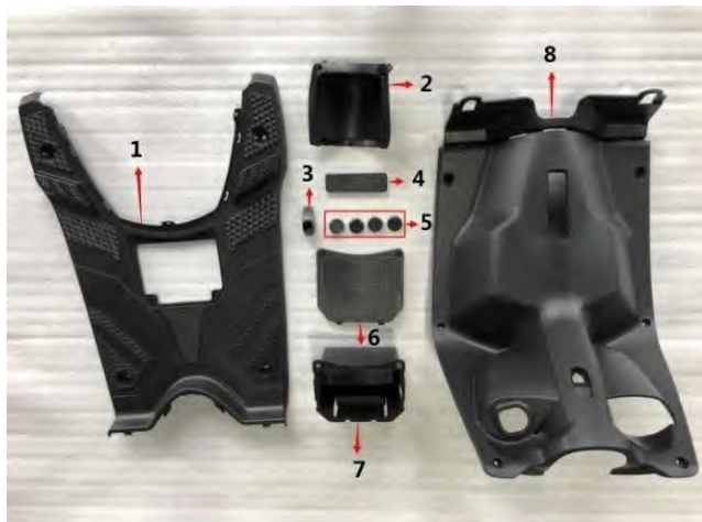
Figure I: foot skin, battery cover, etc (图I: 脚踏皮、电瓶)