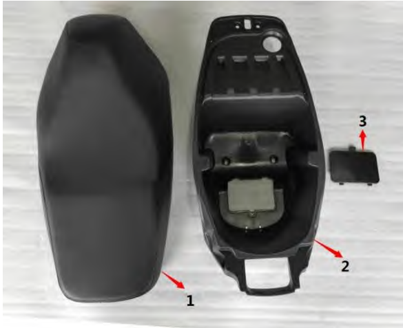
Figure L: seat, glove box, etc (图L: 坐垫、杂物箱等)