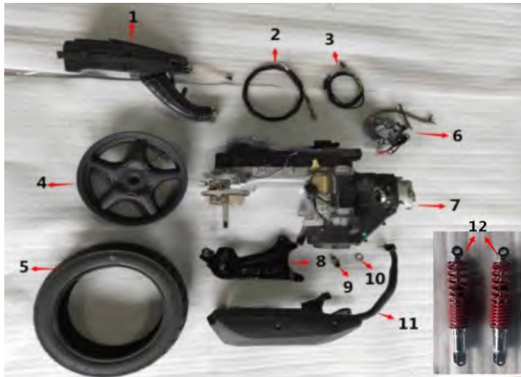
Figure B: filter,rear brake cable,etc(图B:空滤、后刹车线等)