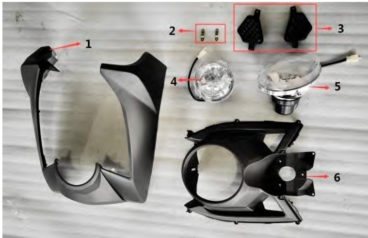
Figure G: front wall, headlight, etc (图G:前围, 前大灯等)