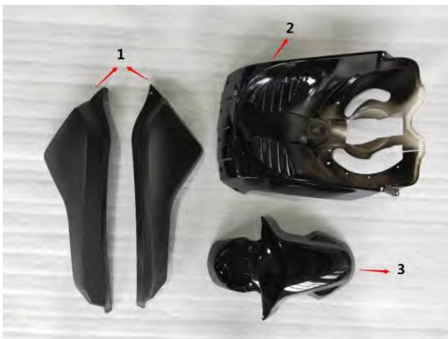
Figure K: (decorative plate, front fender, etc) (图K: 左右)