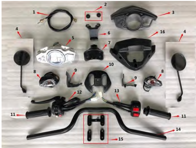
Figure E: instrument, seat direction, etc (图E: 仪表、方向把座)