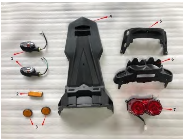
Figure D: fender, rear lamp, etc (图D: 挡泥板, 后尾灯等)