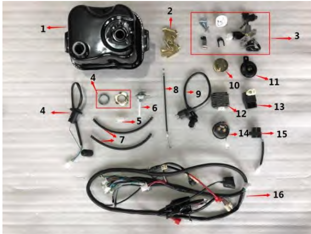
Figure H: fuel tank, igniter, etc (图H: 油箱、点火器等)