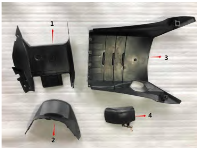
Figure J: fuel tank bottom, Glove box front cover, etc (图J: 油箱底板、杂