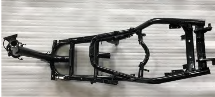
Figure A: frame(图A:车架)