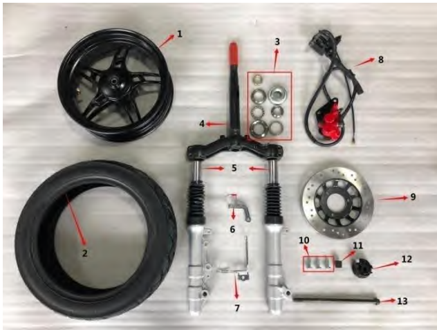
Figure C: front wheel, front shock, etc (图C: 前轮、前减震等)