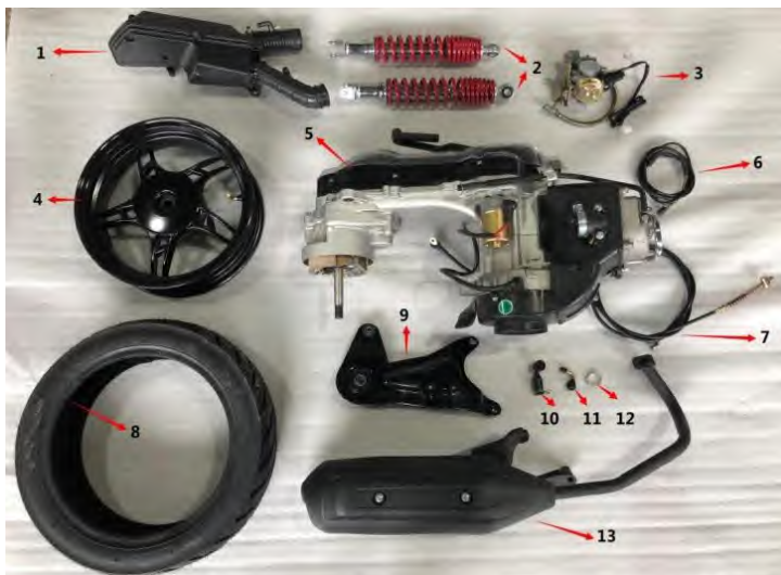
Figure B: rear shock,muffler,etc(图B:后减震、消音器等)